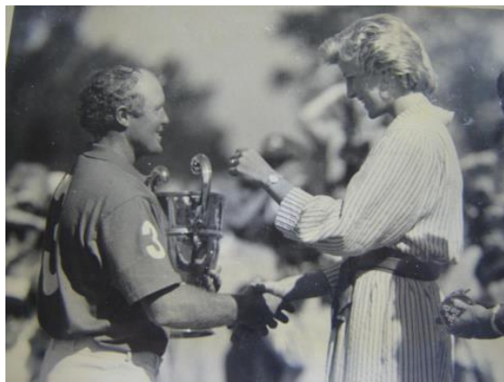
"Pat with Diana, Princess of Wales"