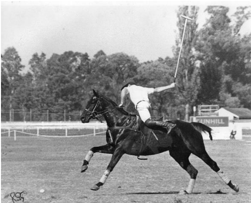
"Pat, playing Louis at Warwick Farm"