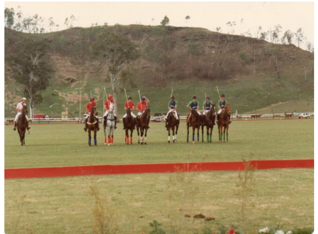
"Pat playing in Victoria"