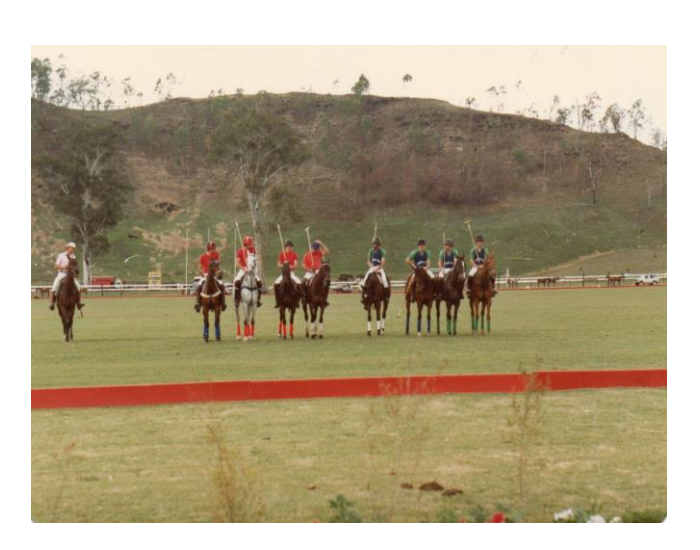
"Pat playing in Victoria"