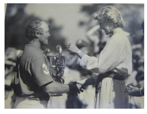
"Pat with Diana, Princess of Wales"