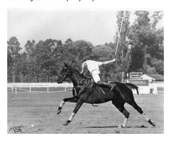
"Pat, playing Louis at Warwick Farm"