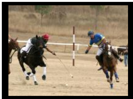
15 July 2004