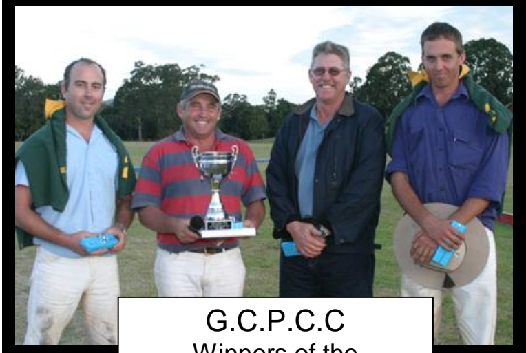
G.C.P.C.C Winners of the Quarterdeck Cup 2004