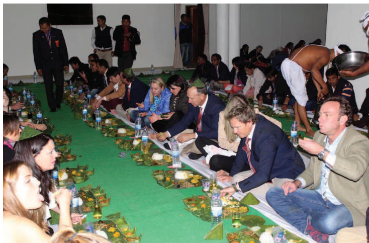
Players enjoying traditional Manipuri Dinner (Nov 27, 2014)