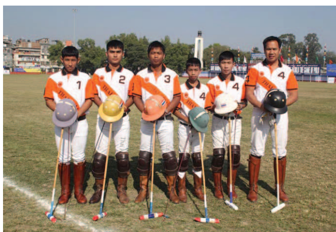
Thailand Polo Team