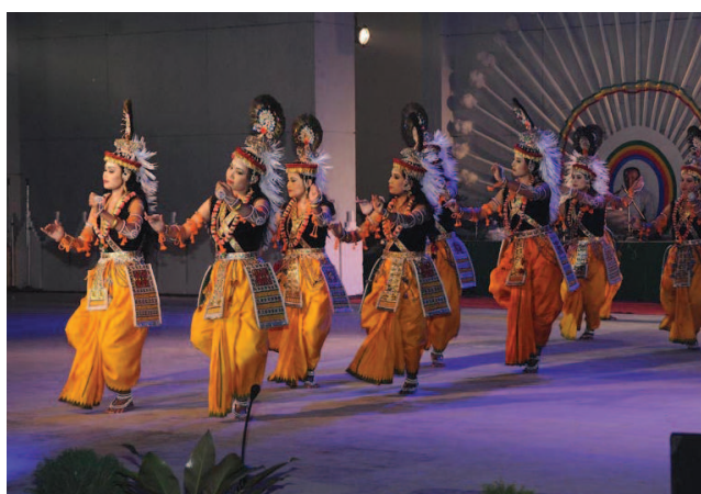
Cultural Evening at Sangai Festival, Palace Compound witnessed by the Polo Players