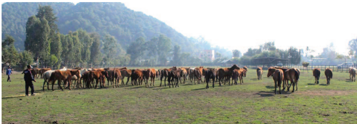
Manipuri Pony at Manipuri Pony Breeding Farm, Lamphelpat, Imphal