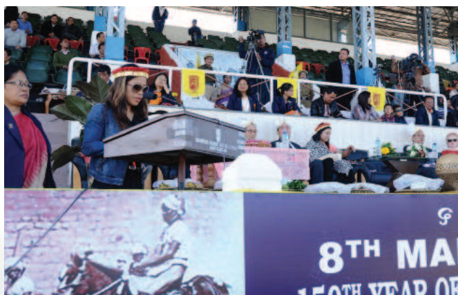
Mrs. MC Mary Kom, Olympic Bronze Medallist (Boxing) & 5 times World Champion (Boxing) delivering Welcome Speech as Chief Guest (November 24, 2014)