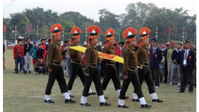
Flag lowering ceremony of the Closing Function (Nov 29, 2014)