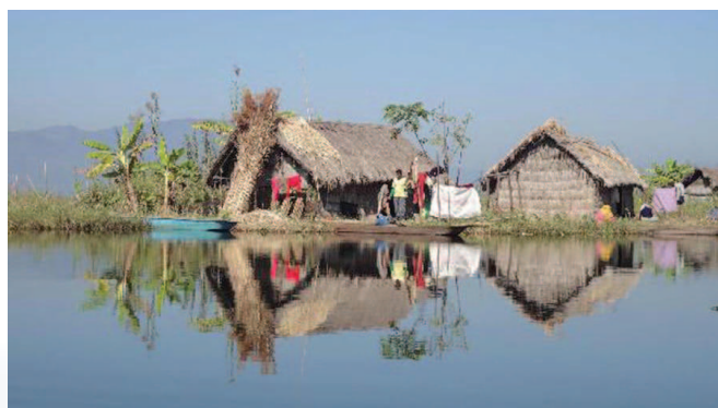
Huts on floating Phumdi (floating Phumdi is available only at Loktak Lake in the World)