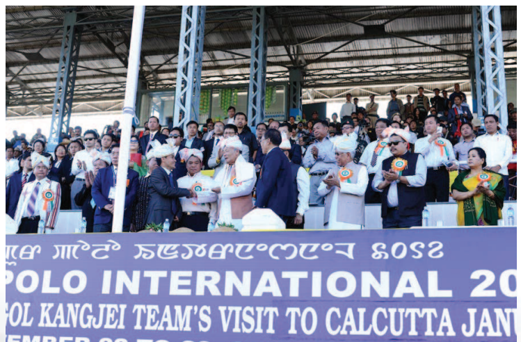
Shri O. Ibobi Singh, Hon'ble Chief Minister, Manipur receiving VVIPs from Thailand