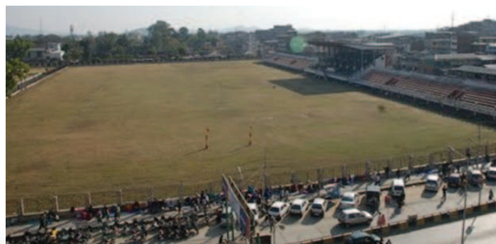
Mapal Kangjeibung (Imphal Pologround) – the oldest living Pologround in the World

All the matches shall be played at the historic Mapal Kangjeibung i.e. Imphal Pologround, the oldest living Pologround in the world. The present size of the Pologround is 190 meters x 90 meters. Imphal is the Capital of Manipur State in India and is well connected by flights from New Delhi/Kolkata/Guwahati as well as by road via Kohima, Nagaland.