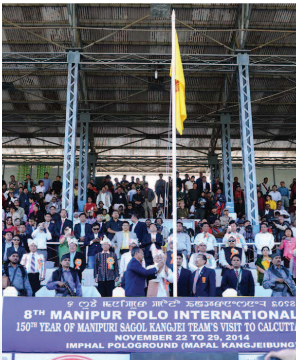
Shri O. Ibobi Singh, Hon'ble Chief Minister, Manipur hoisting flag at Inaugural Function of the 8th Manipur Polo International 2014