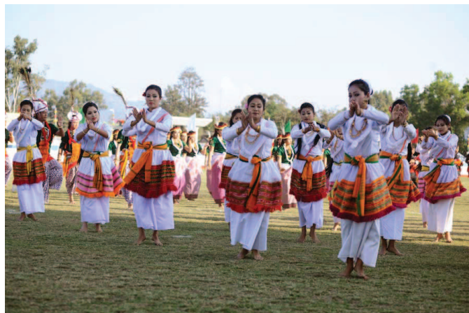
Cultural Show at the Inaugural Function (Nov 22, 2014)