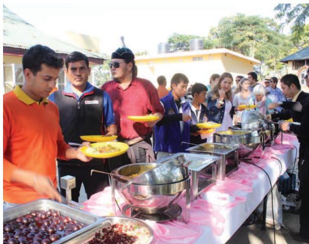
Players enjoying lunch at Sendra Tourist Home, Loktak