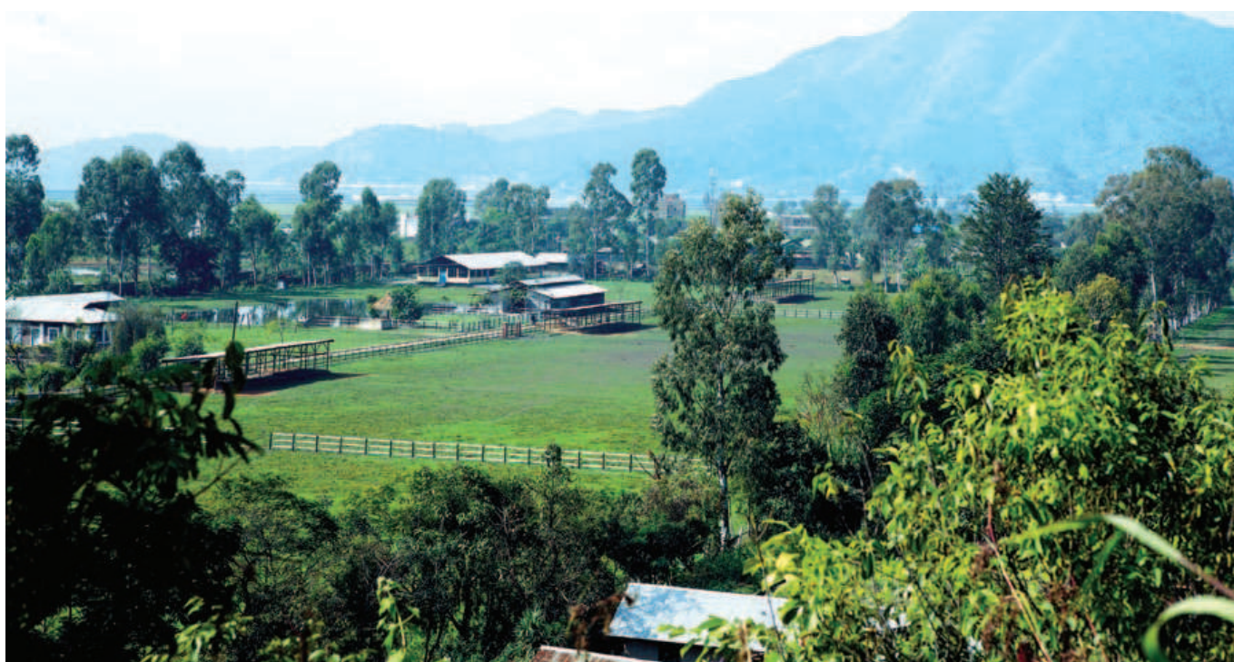
Aerial view of Manipuri Pony Breeding Farm, Lamphelpat, Imphal