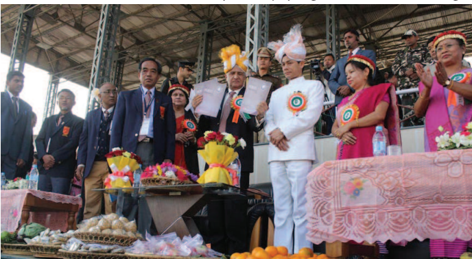
Releasing of Souvenir of the Tournament by Dr KK Paul, Hon'ble Governor of Manipur