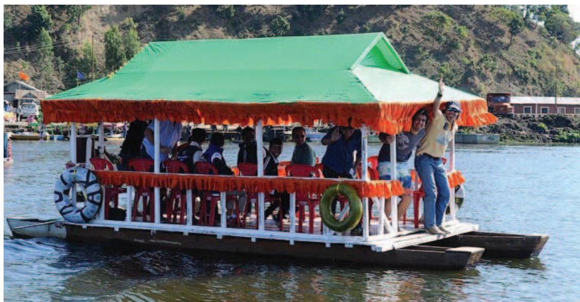
Polo Players enjoying boat ride at Loktak Lake, the largest lake of North Eastern India