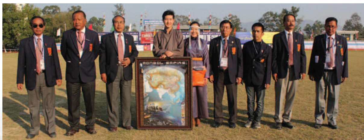
Presenting of Mememto by Genghis Khan Polo Club, Mongolia to the Manipur Horse Riding & Polo Association