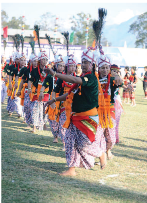
Cultural Show at the Inaugural Function (Nov 22, 2014)