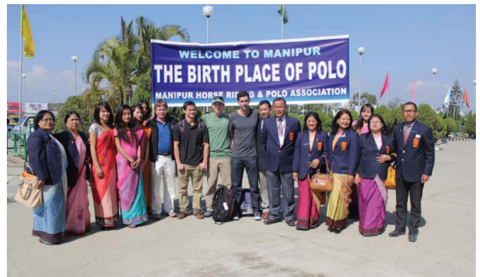
Volunteers with Polo players on arrival at Imphal International Airport