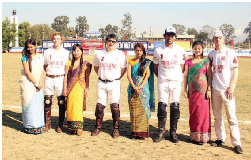
England Polo Team