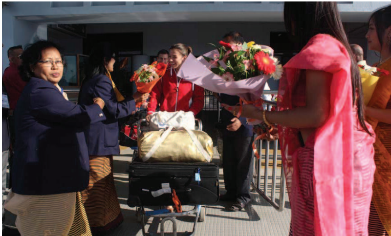
Lady Volunteers receiving the Polo players at Imphal International Airport