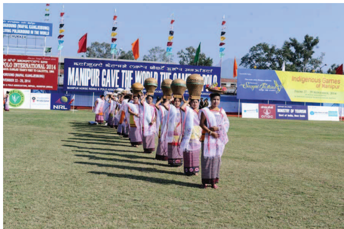
Lady Volunteers with Potlaanba items - the traditional reception items of Manipuri