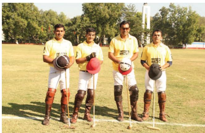
India-A (Indian Polo Association) Polo Team