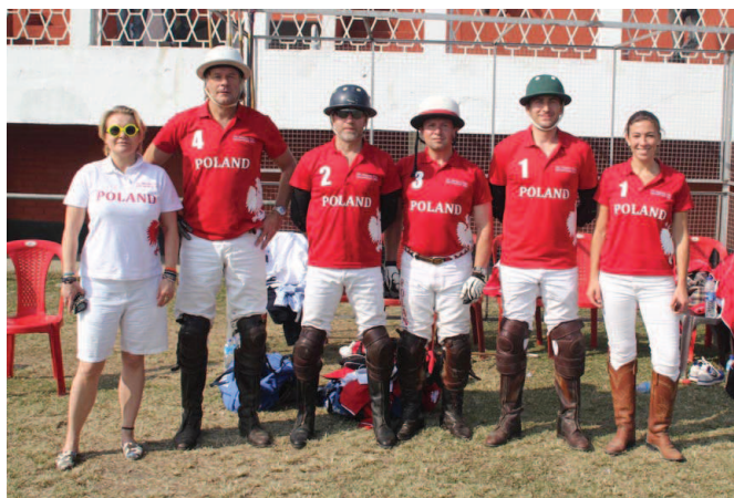
Poland Polo Team