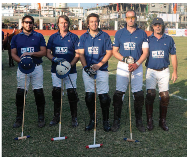
France Polo Team