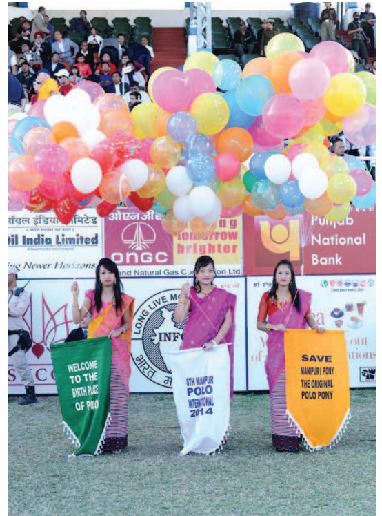
Welcome to Manipur, the Birthplace of Polo