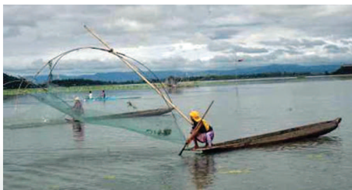
A fisherwoman catching fish at Loktak Lake