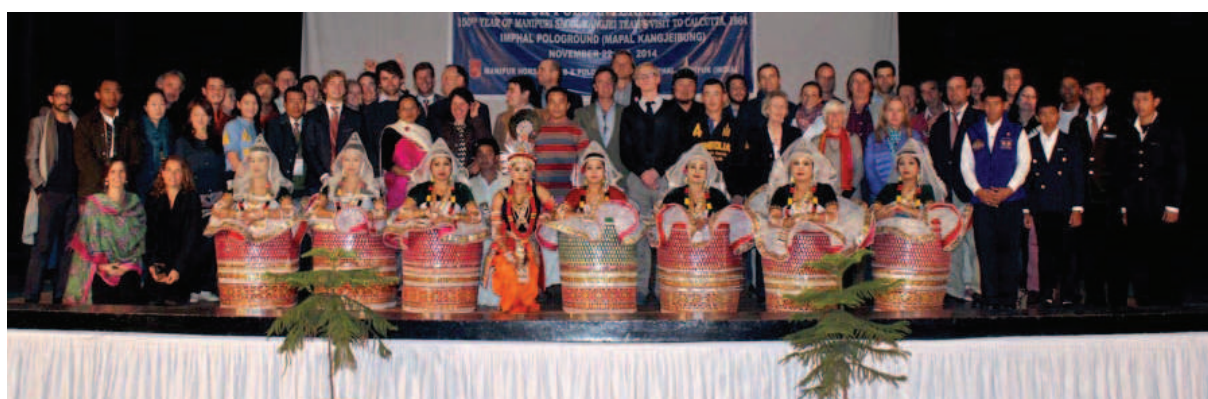
Polo Players with the Artists (Nov 27, 2014) at Banquet Hall, 1st Bn Manipur Rifles