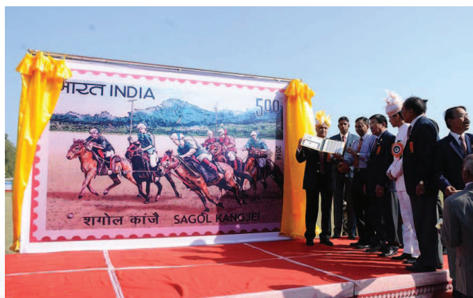
Releasing of Commemorative Stamp of Sagol Kangjei by Dr KK Paul, Hon'ble Governor of Manipur