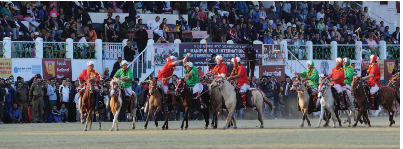
Polo Players enjoying the Traditional Sagol Kangjei, the Forerunner of Modern Polo