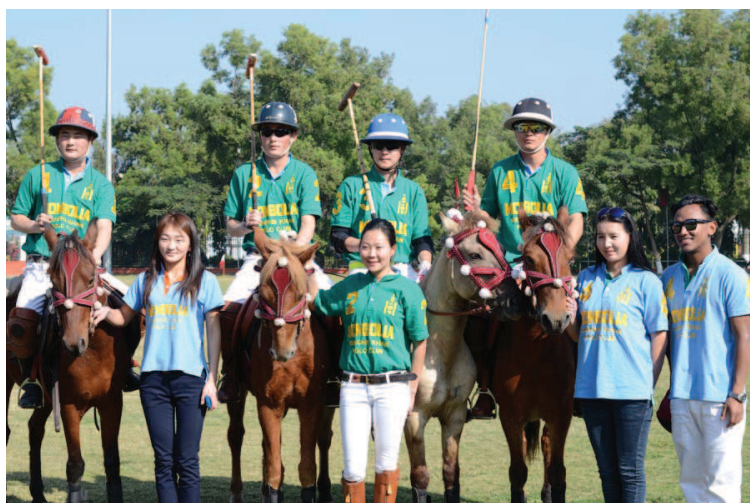
Mongolia Polo Team