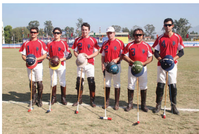
United States Polo Team