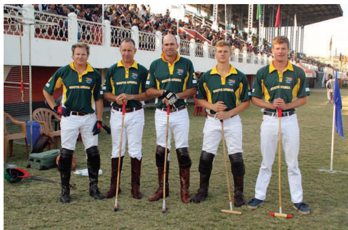
South Africa Polo Team