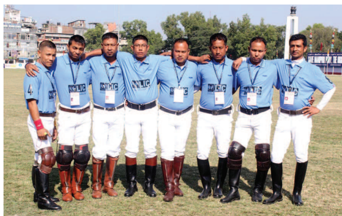
India-B (Manipur) Polo Team