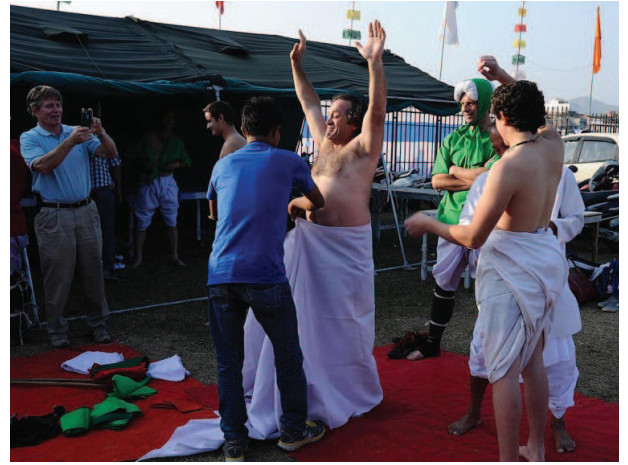
Polo Players dressing up for Traditional Sagol-Kangjei