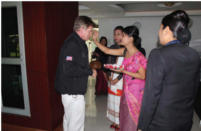
Reception at Imphal Hotel, Imphal